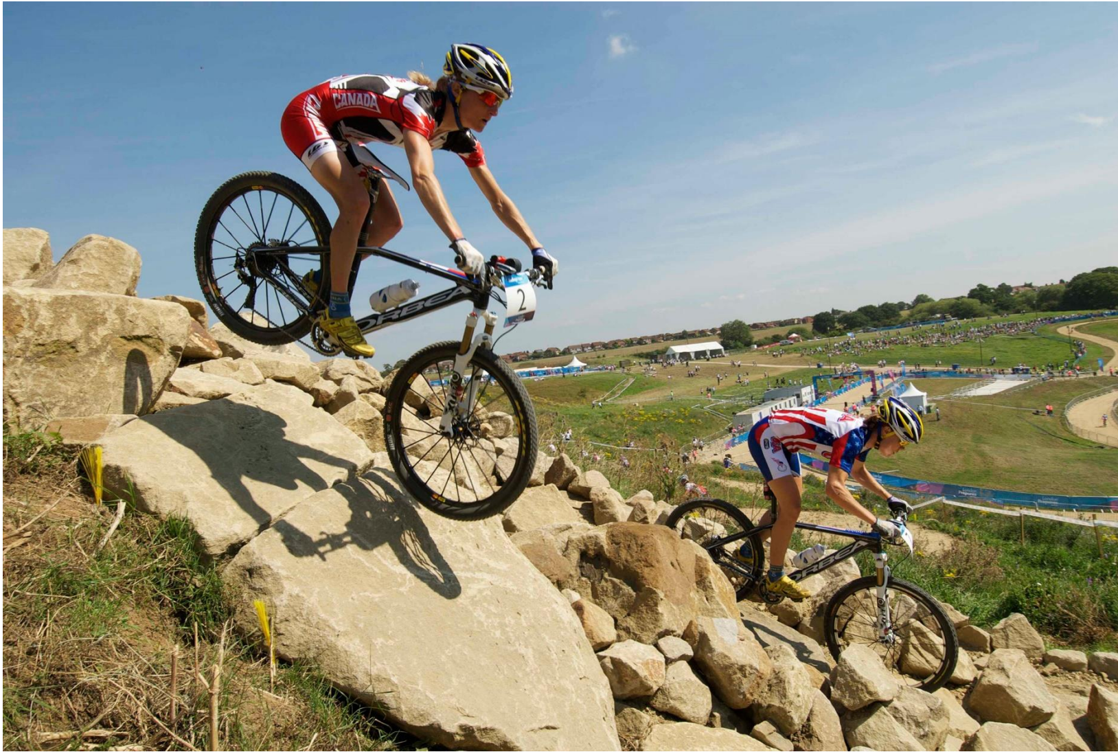
The Dirt on Hosting Olympic Mountain Biking — Without Mountains | WIRED