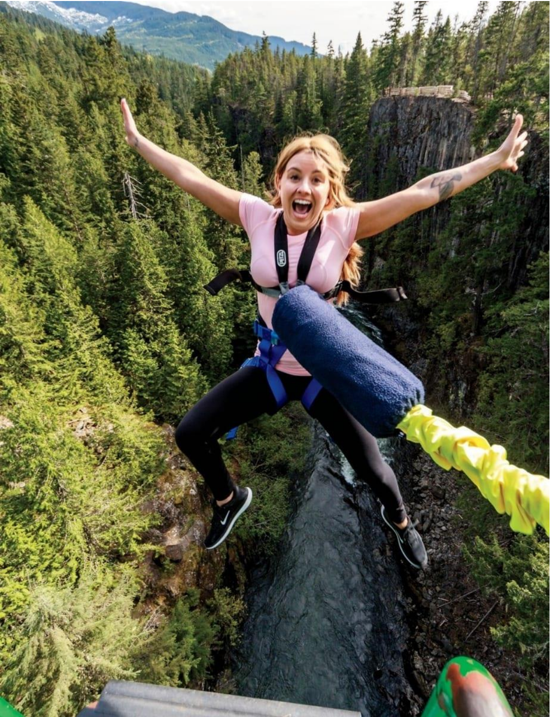
Bungee Jumping | Experience | Adventure | Whistler, Canada (premiumwhistler.com)