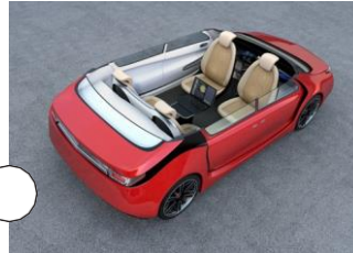
First driverless car