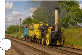
First passenger steam locomotive