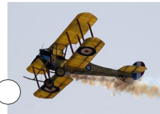
First powered aircraft