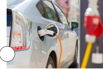
First electric car