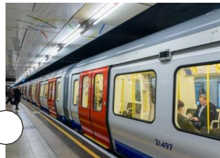
First electric London Underground