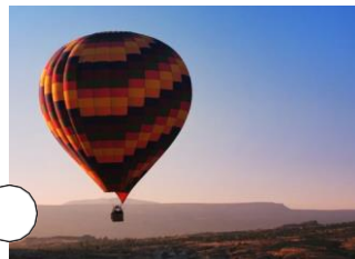
First manned hot air balloon ride